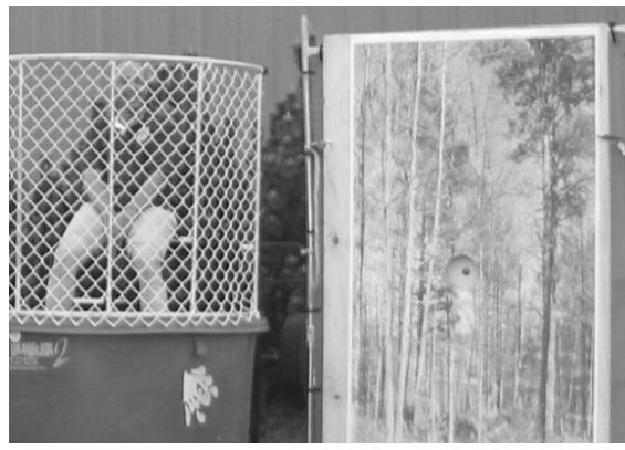
Seth Mitchell staying dry with the buffer strip to protect him.

suits! As they rolled down the artificial hill pretending to be water