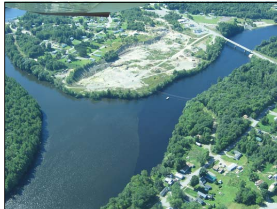
E. & W. Branch Confluence

88.8% of 105,722 cells/ml were potentially toxigenic cyanobacteria