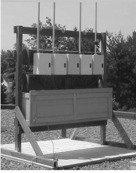
The IMPROVE monitor at Marsh Island apartments