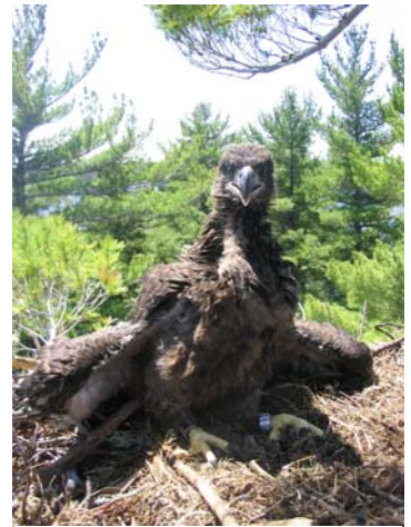
Eaglet who had both legs banded at Seboeis Lake.