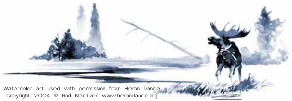
Watercolor art used with permission from Heron Dance. Copyright 2004 © Rod MacIver www.herondance.org